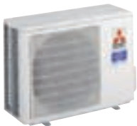
Outdoor unit PUY-A12/18NHA3