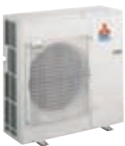
Outdoor unit PUY-A24/30/36NHA3